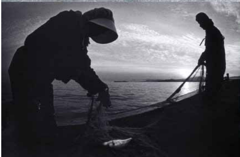
Minamata photos by W. Eugene Smith and Aileen M. Smith