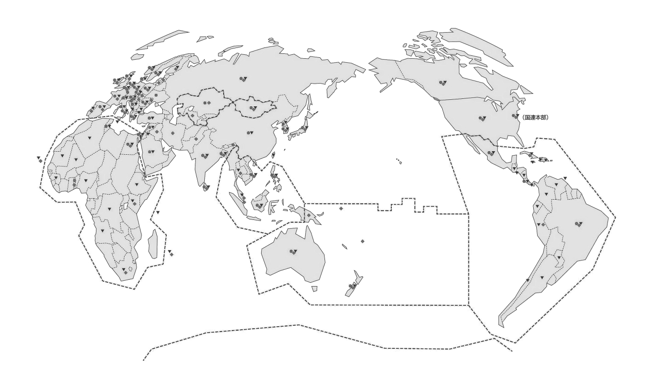
Map: Activities to "disseminate the realities" across the world